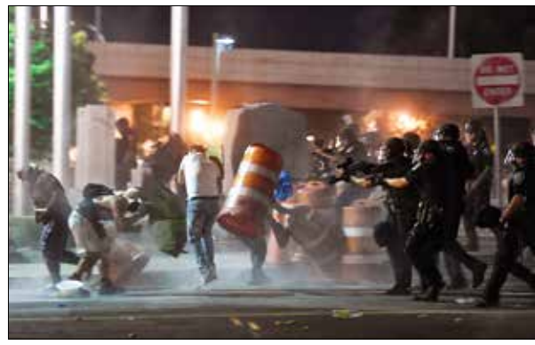
Police officers force a line of demonstrators away from the front of the Public Safety Building in Rochester, New York

Journalists were among those hit by pellets during the confrontation, which came